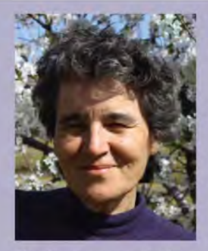
Project presentation April 22 1500