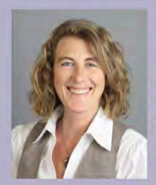
Keynote Lecture April 22 9<sup>30</sup>