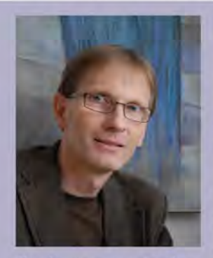
Project presentation April 22 16<sup>30</sup>